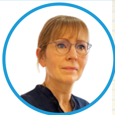
Valerie Julliard UN Resident Coordinator in Indonesia

Dear readers, As an archipelagic country with an ocean covering more than two-thirds of the country's area, building a sustainable ocean economy is vital for Indonesia. Indonesia is strategically positioned to lead and influence political and economic stability and ocean development in the region.