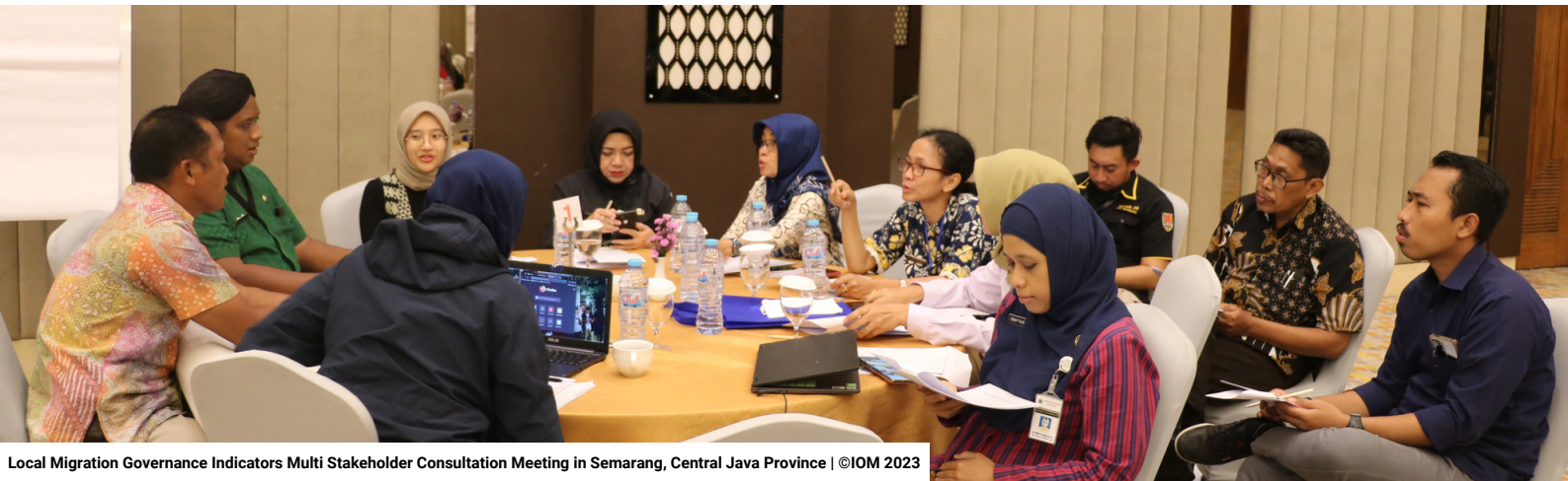
Local Migration Governance Indicators Multi Stakeholder Consultation Meeting in Semarang, Central Java Province