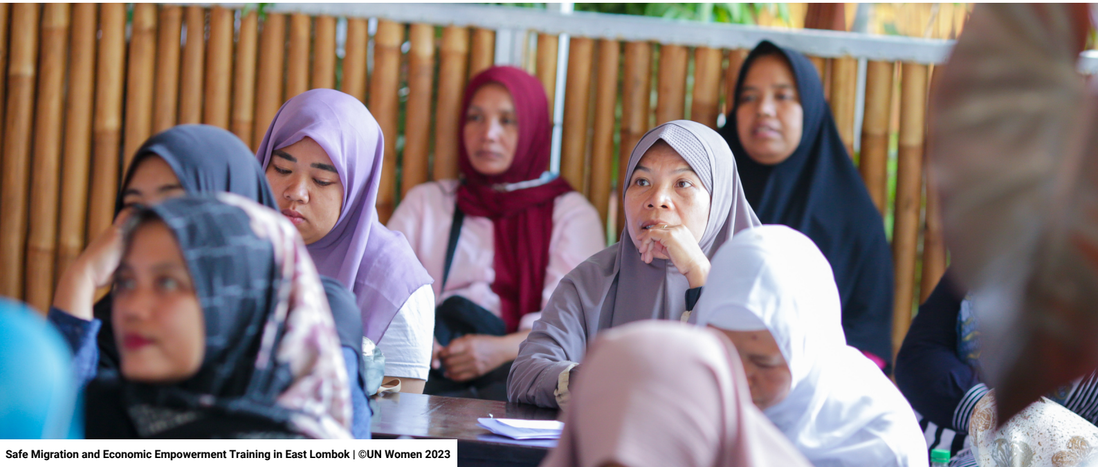
Safe Migration and Economic Empowerment Training in East Lombok