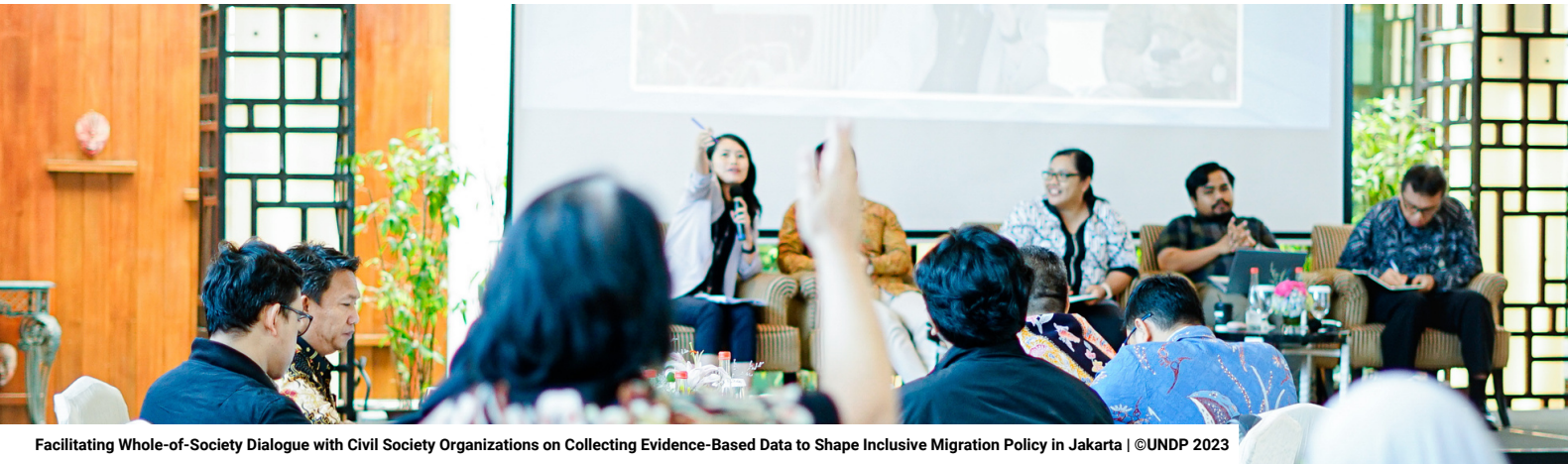
Facilitating Whole-of-Society Dialogue with Civil Society Organizations on Collecting Evidence-Based Data to Shape Inclusive Migration Policy in Jakarta