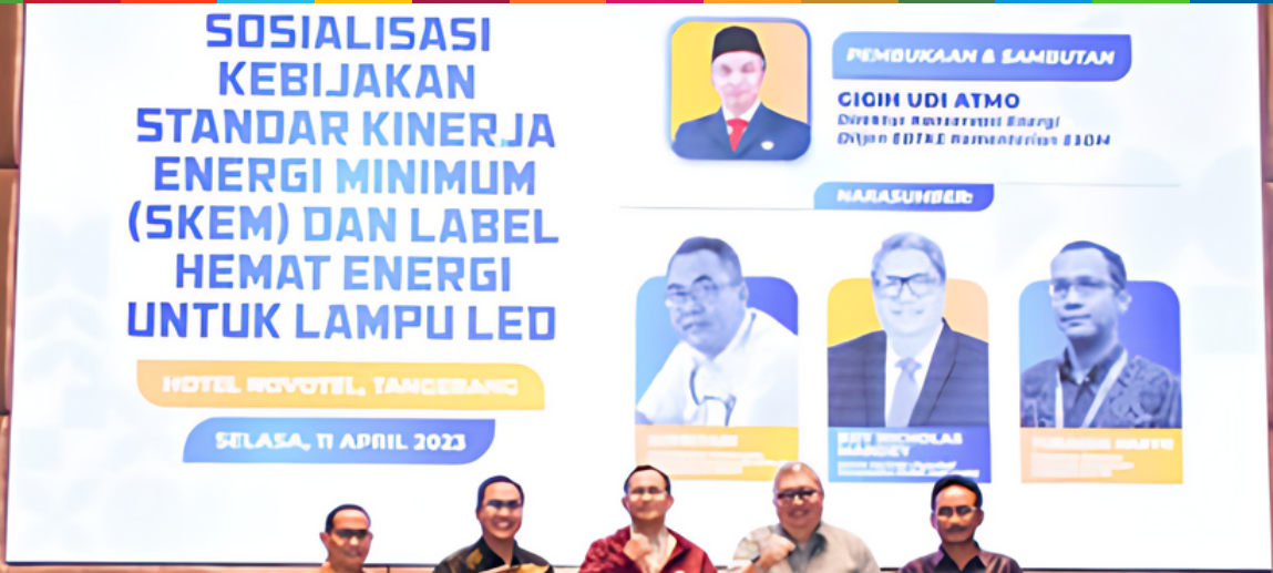
Socialization of the Ministerial Regulation on MEPS in Jakarta

ADLIGHT facilitates issuance of the Ministry of Energy Decree no 135/2022 on Minimum Energy Performance Standard (MEPS) and Labelling for light-emitting diode (LED) light