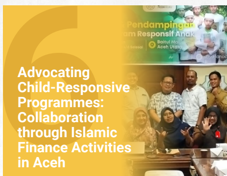
Advocating Child-Responsive Programmes: Collaboration through Islamic Finance Activities in Aceh