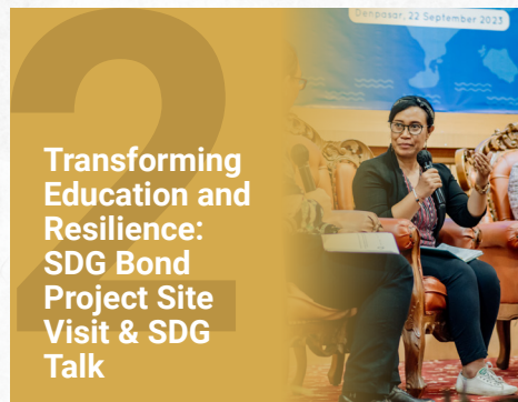
Transforming Education and Resilience: SDG Bond Project Site Visit & SDG Talk