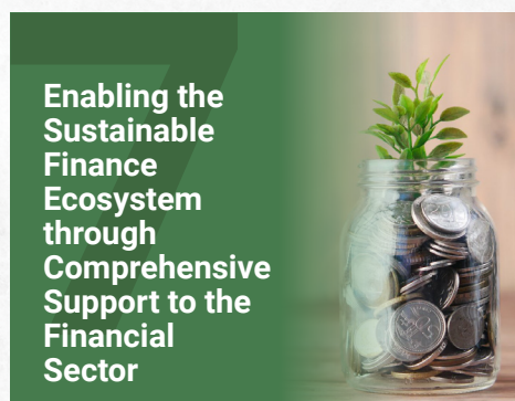
Enabling the Sustainable Finance Ecosystem through Comprehensive Support to the Financial Sector