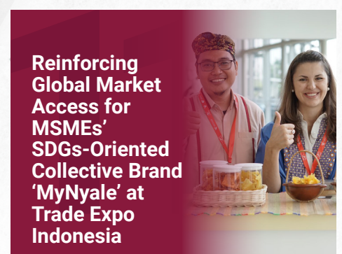
Reinforcing Global Market Access for MSMEs' SDGs-Oriented Collective Brand 'MyNyale' at Trade Expo Indonesia