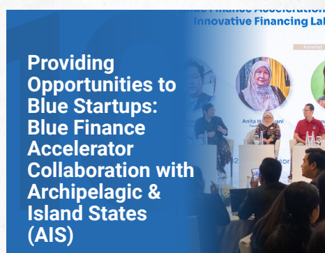
Providing Opportunities to Blue Startups: Blue Finance Accelerator Collaboration with Archipelagic & Island States (AIS)