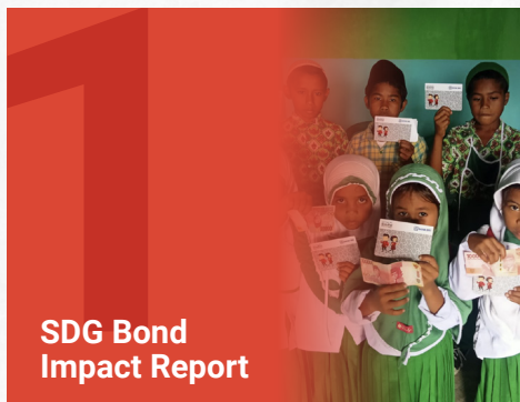
SDG Bond Impact Report