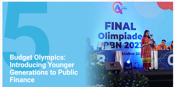
Budget Olympics: Introducing Younger Generations to Public Finance