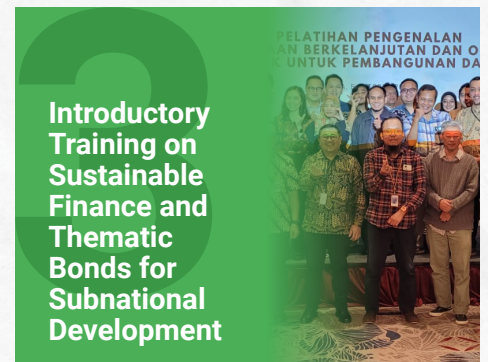
Introductory Training on Sustainable Finance and Thematic Bonds for Subnational Development