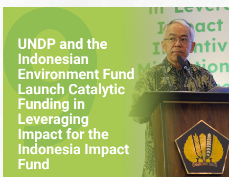
UNDP and the Indonesian Environment Fund Launch Catalytic Funding in Leveraging Impact for the Indonesia Impact Fund