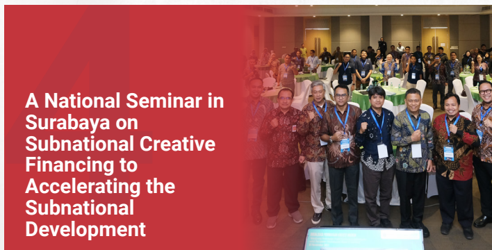
A National Seminar in Surabaya on Subnational Creative Financing to Accelerating the Subnational Development