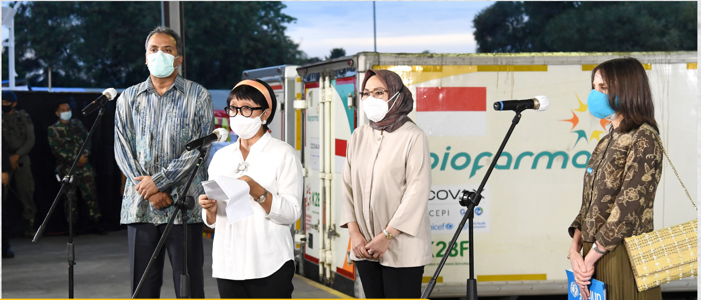
Photo left to right: Dr N. Paranietharan (WHO Rep to Indonesia), Retno Marsudi (Minister of Foreign Affairs), drg. Arianti Anaya (MoH), Debora Comini (UNICEF Indonesia Country Rep)

On the 8th of March 2021, Indonesia received 1,113,600 doses of the AstraZeneca vaccine as the first shipment of the 11,704,800 doses allocated to Indonesia under the COVAX Facility until May. COVAX is co-led by Gavi, the Vaccine Alliance, the World Health Organization (WHO) and the Coalition for Epidemic Preparedness Innovations (CEPI), with UNICEF as a key implementing partner. Indonesia's Minister of Health and Minister of Foreign Affairs were present to receive the shipment, along with COVAX partners.